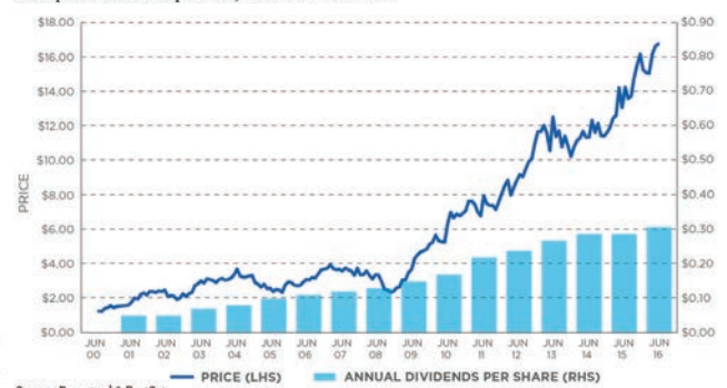
CHART 2: ARB CORPORATION HAS PROVIDED STRONG EARNINGS AND DIVIDENDS GROWTH Share price vs dividends per share, June 2000 – June 2016

ARB Corporation is Australia’s largest manufacturer and distributor of 4x4 accessories. Having grown from a family garage in Melbourne, the company now has a large international presence and distributes its products to more than 100 countries around the globe. Management’s unwavering focus on quality, product innovation and cost control has allowed the business to continually expand at a steady pace over time, maintaining consistently strong profit margins, earnings and cash flow.